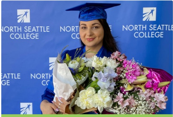
2021 Graduation and Juneteenth Celebration