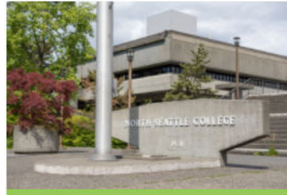
Sound Transit hits 'exciting' milestone