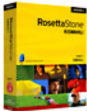
Rosetta Stone Swahili Course

Overview and history of Swahili + some lessons